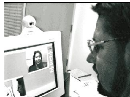
This unretouched image was taken with QuickCam.

Use the QuickCam software to put yourself in the picture. QuickCam includes a screen saver with live video! Create a photo gallery for your desktop. QuickCam software integrates perfectly with Macintosh programs, so you can add live video and still images to all of your favorite applications. The possibilities are limited only by your imagination.